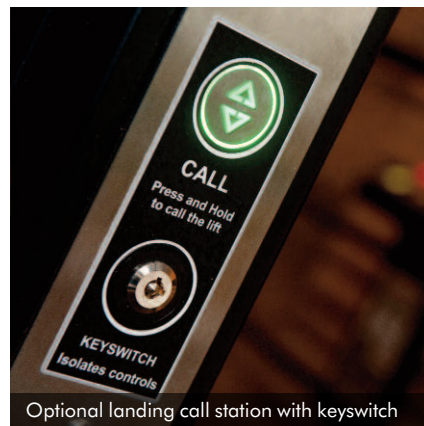
Optional landing call station with keyswitch