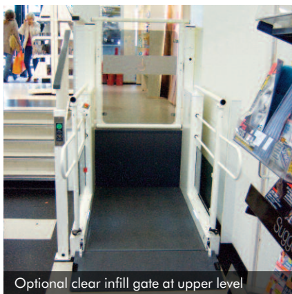
Optional clear infill gate at upper level