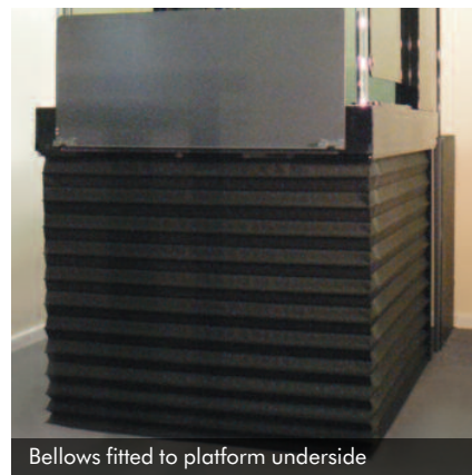
Bellows fitted to platform underside