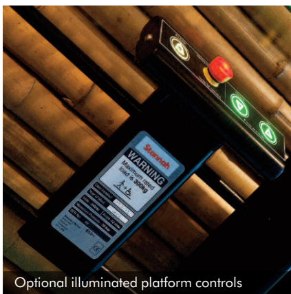
Optional illuminated platform controls