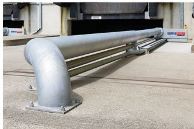
Easy to install above ground.