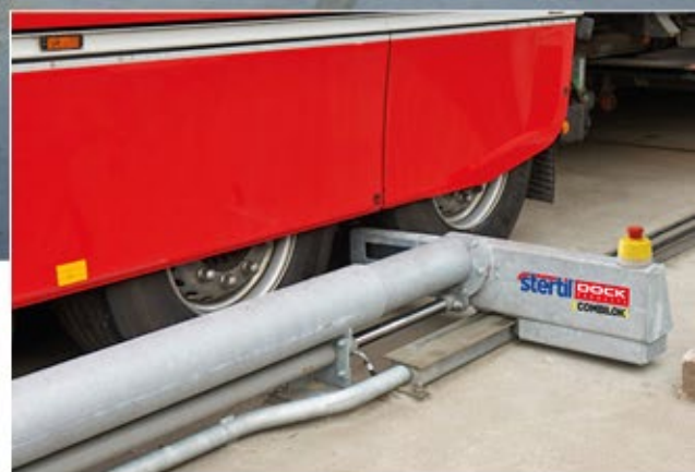
No damage to mudguards or side skirts due to the low height of the wheel block.