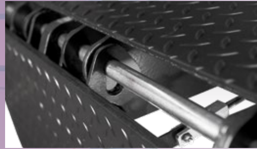
Unique open lip hinge