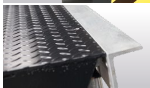
Closed rear hinge