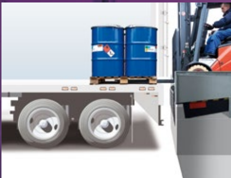
Below Dock Control