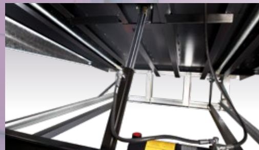
One hydraulic (main) cylinder