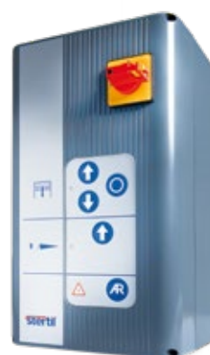
Advanced control box

The P-Series offers numerous possibilities customised to your dock for most efficient use. The length of the platform will primarily be determined by the height difference between the warehouse floor and the expected range of truck beds. Steril bases its sizes on a lower maximum incline than is permitted by EN 1398 Directive, in order to guarantee smoother loading and unloading with less physical strain. We would be happy to advise you about the most efficient sizes and designs at the early stages of dock planning.