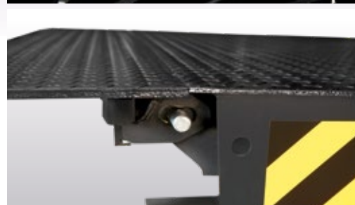
Horizontal lip in all positions