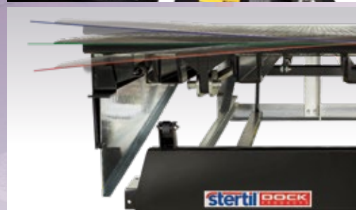
The platform can tilt 125 mm at both sides