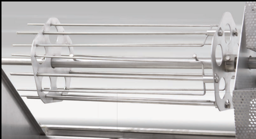
Mini Poultry Rack Illustrated