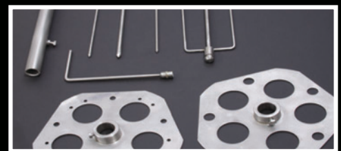
Easy assembly, cleaning and storage