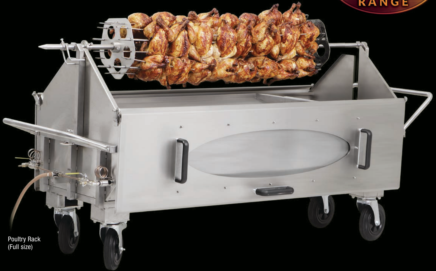
Poultry Rack (Full size)