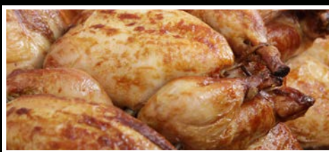
Tender Chicken roasted to perfection