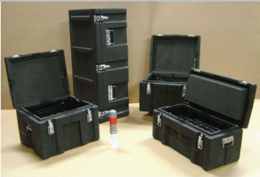
Grenades cases designed and produced for Gendarmerie Nationale of France