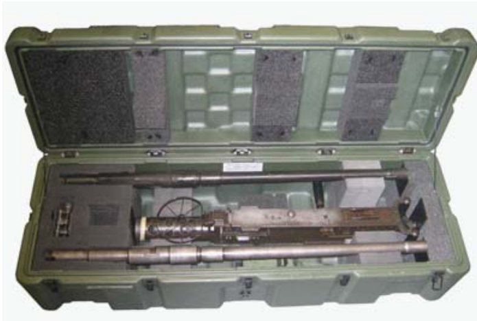
Weapons Case for Browning M2 heavy machine gun with spare barrel.

CP Cases are able to call upon an extensive library of design and build configurations to cater for the complete spectrum of firearms from pistols and sub-machine guns, through rifles and personal defence systems, to squad support and heavy assault weapons. They even have the capability to produce cases for artillery rounds and vehicle-mounted ordnance as well as ceremonial and legacy weapons.