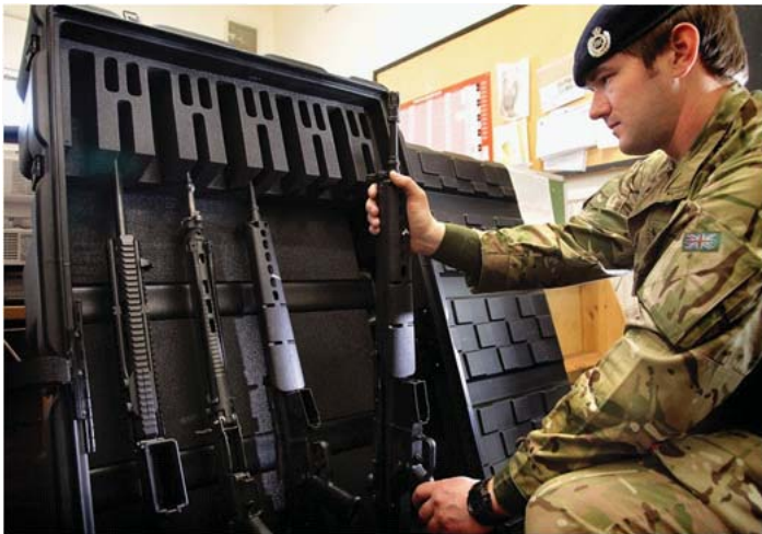
CP Cases' Weapons Case being used to store a variety of arms in a British Army armoury.

The need for the armed forces, police and civil security directorates, law enforcement agencies and private security companies to secure, store and transport firearms in the most convenient and robust way has always been a challenge. CP Cases solution is their range of custom-designed Weapons Cases.