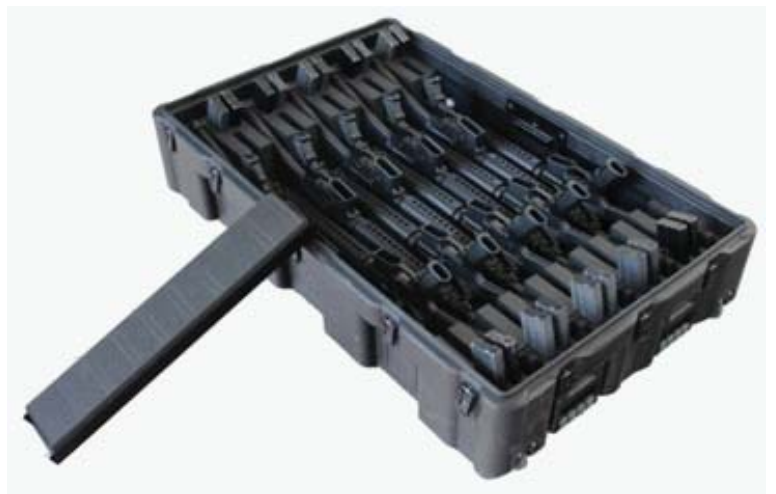
Left: Populated pistol case complete with storage for spare magazines Right: Fully loaded rifle case with restraining bar open