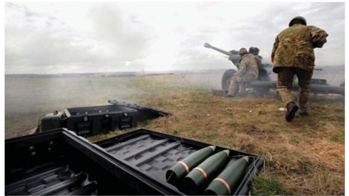
Weapons Cases being used on exercise by the Royal Artillery for storage and transport of shells and charges

CP Cases has extensive experience in designing and manufacturing ruggedised OEM cases and containers, and are able to provide practical solutions for unique applications, when a case or an extremely tough container is required for deployment, transport or storage.