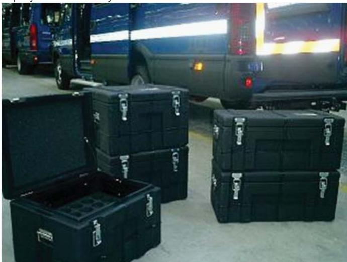
CP Cases' Grenade Cases in use with the Gendarmerie in France.

Exploiting a wide range of standard sizes and extensive design capabilities, CP Cases work with customers to create a tailor-made product, delivering the perfect solution to protect, secure and deploy firearms in any situation.