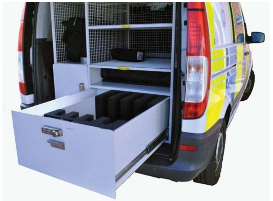
The same skills and expertise are applied constructing secure in-vehicle storage systems for the British Transport Police Fast Response Units