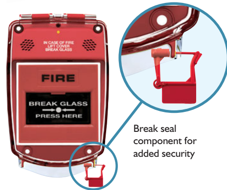
Break seal component for added security

Fully rotational hinge provides increased protection against vandalism