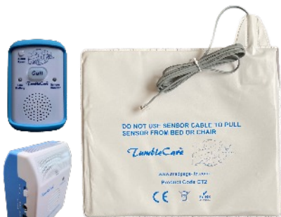
5-Channel alarm station

ORDER CODE TUMCSRXTK PRICE £100.30 (120.36)