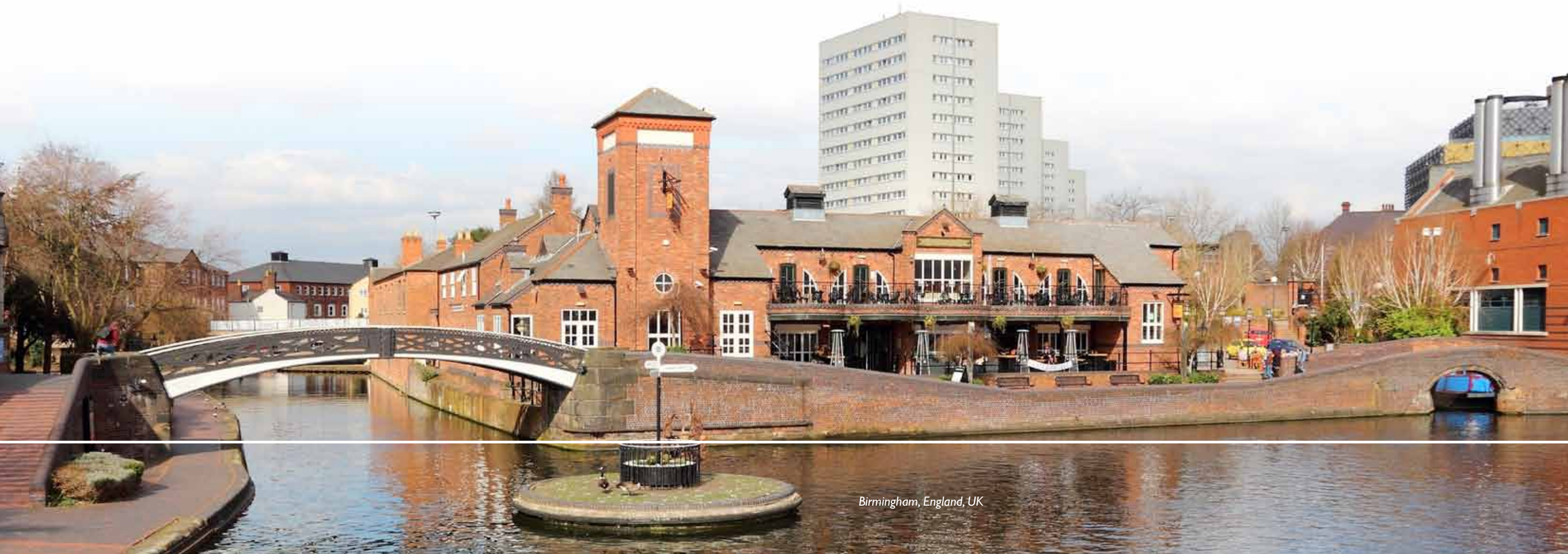
Birmingham, England, UK

“ We deliver a comprehensive service throughout the UK via our network of registered Engineers and telephone support staff. ”