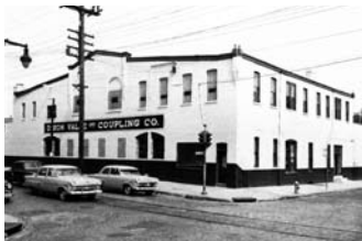
Warehouse and shipping building at 2nd and Columbia in Philadelphia

Due to his ongoing interest and innovative approach to coupling design, he started the Dixon Valve and Coupling Company which produced products for the mining, oil and construction industries.