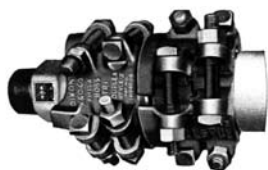
Rotary Hose Coupling