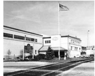
Chestertown, Maryland manufacturing facility

In 1976, the Dixon Group moved its headquarters and the largest USA manufacturing base to Chestertown Maryland, where it remains today.