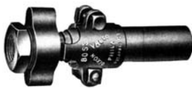
Original "Boss" Coupling, patented 1917