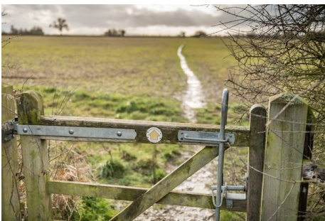
REMOTE LOCATIONS (NO POWER)