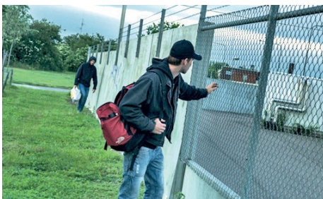
PERIMETER INTRUDER DETECTION