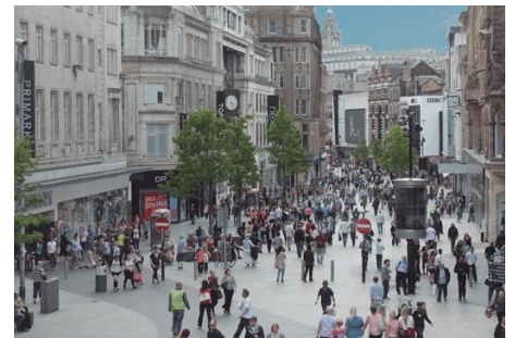
PUBLIC SPACE SURVEILLANCE