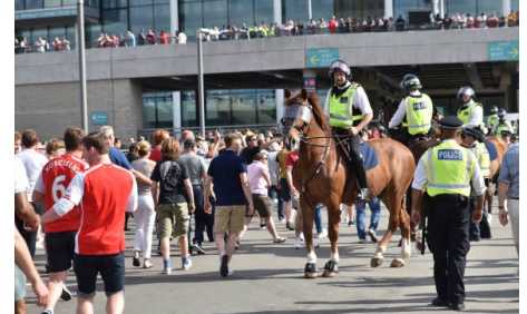
CROWD CONTROL (NO POWER)