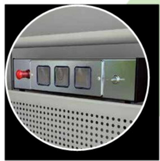
The on-board and floor control panels are equipped with keys and can be used easily.