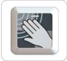
Sticker Option 1