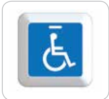
Sticker Option 2