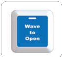
Sticker Option 3