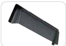
WC/BL Black weather cover