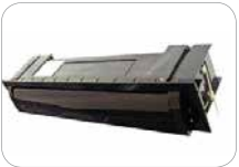
HA-120 Ceiling recessed bracket