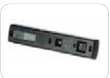
BF-1 Spot-finder installation tool