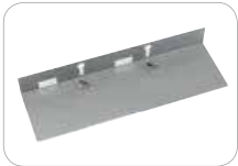
UTB-HR100 Ceiling attached bracket