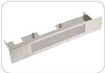
ITB-HR100 Ceiling recessed bracket