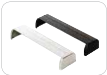
HR100-COV/BL Black sensor cover HR100-COV/S Silver sensor cover