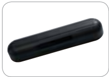
SSR-3-COV/BL Black sensor cover SSR-3-COV/S Silver sensor cover