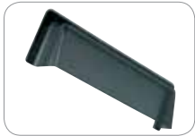
WC/BL Black weather cover