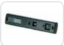
BF-1 Spot-finder installation tool