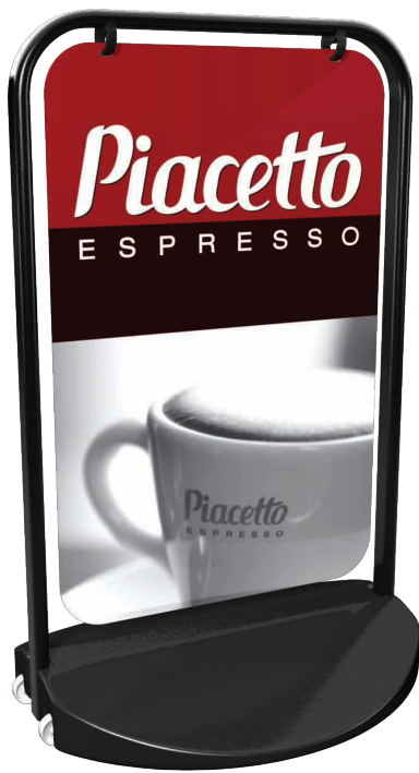
Shown with printed panel and stock colour black frame