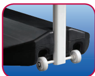
In-built wheels allow ease of movement in and out of store