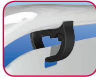
Patented D-Flex panel hangers