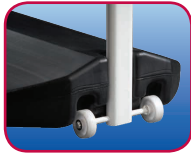
In-built wheels allow ease of movement in and out of store