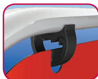
Patented D-Flex panel hangers