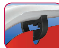
Patented D-Flex panel hangers