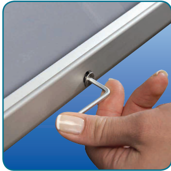
Single screw on bottom edge locks all 4 sides

Simple Allen key operation and sequentially opening sides keep your posters safe.