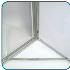
Optional door stays on larger models