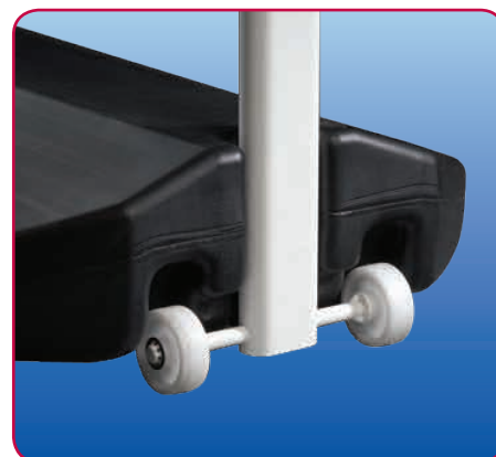
Built-in wheels on larger 3000 and 4000 models for ease of movement and health and safety compliance

Optional clip-on 'Tactical Headers' for promotions, available for Swinger 2000, 3000 and 4000