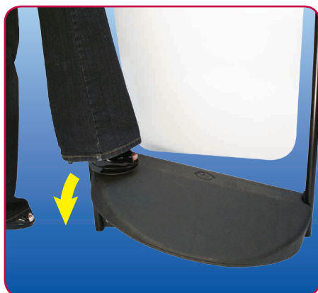
All Swingers have the simplest 'no tools' assembly

For a one-off tooling charge, logos can be moulded into bases (minimum order quantity: 100)