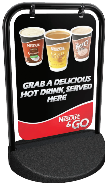
Shown with printed panel and stock colour black frame