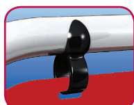
New anti-shock 'D-Flex' panel hangers