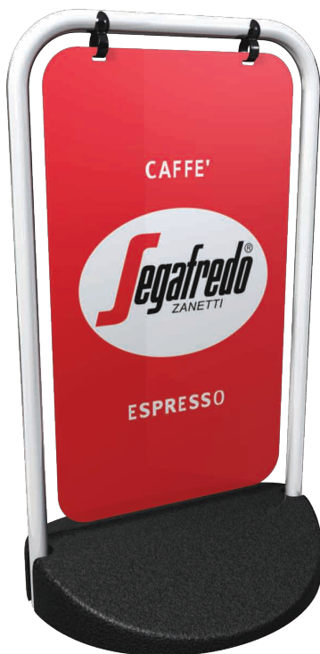
Shown with printed panel and stock colour white frame