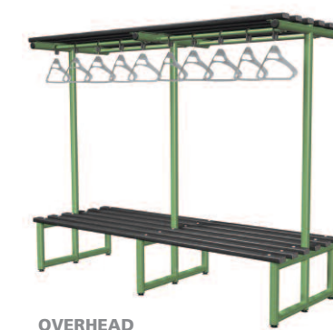
HANGING BENCH double sided with polymer slats and anti-theft hangers

Units maybe supplied in component format including all necessary fixings (excludes wall and floor fixings). All sizes nominal. We reserve the right to alter design and specification without prior consent.