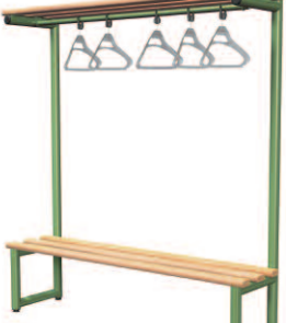
HANGING BENCH single sided with timber slats and anti-theft hangers