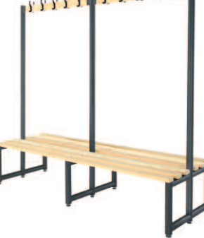
HOOK BENCH double sided with timber slats