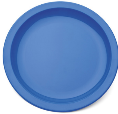
17 & 23cm Plates Code: 071 & 072