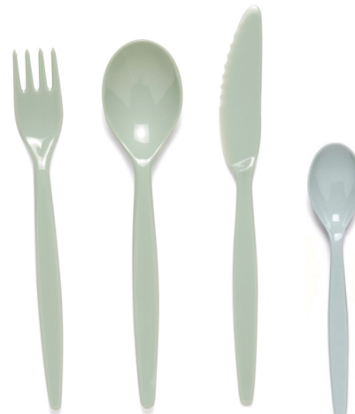
Knife, Fork, Spoon & Teaspoon Code: 076, 077, 078 & 097

Harfield's Biomaster protected tableware is a response to the growing need to do more to tackle disease-causing bacteria.