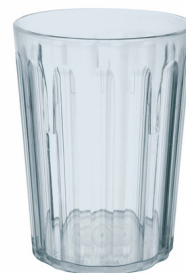
250ml Tumbler Code: 075

Other colour options available, please contact us for more information.