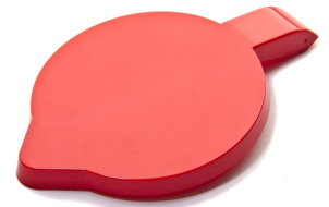
Jug Lids Code: 070