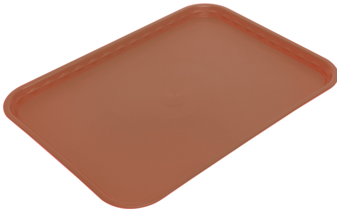
41x30cm Copper Tray Code: 048COP