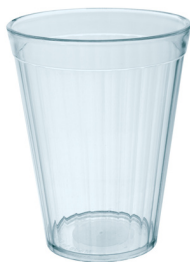
200ml Tumbler Code: 074