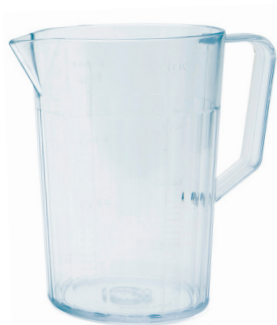
750ml Jug Code: 090