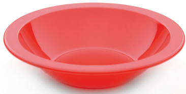
17.3cm Bowl Code: 073