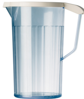
1.1 Litre Jug Code: 069