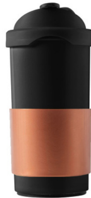
Coffee Cup & Sleeve Code: 260 & 261