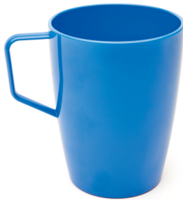
Beaker with Handle Code: 079