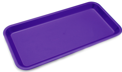
Serving Platter Code: 098