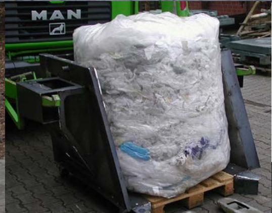
Bale lifting adapter as a tilt-support for refuse collection vehicles