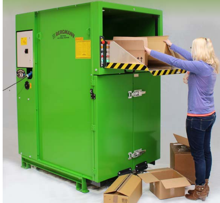
Fig.: BERGMANN PS 1400-E (here with accessory equipment chute) produces a square bale of approx. 1 m 3 from 10 m 3 cardboard. This saves handling and transport costs!

Simply throw it in and forget it; just like a waste bin!