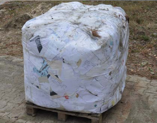
Bale Roto-Compactor PS 1400-E approx. 450 kg paper and cardboard measurements: L 1.200 x W 1.100 x H 1.100