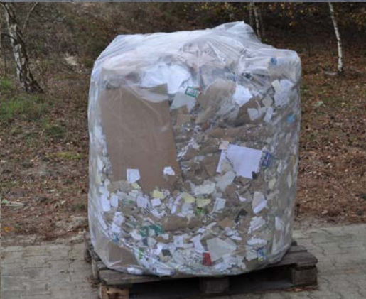
Bale Roto-Compactors PS 8100 & PS 1000-E approx. 300 kg paper and cardboard measurements: L 1.100 x W 1.100 x H 1.100