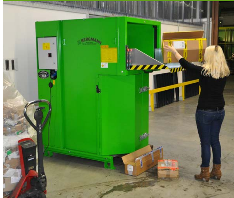
Fig.: BERGMANN PS 1000-E (here with accessory equipment chute) needs a footprint of only approx. 1,20 m x 1,60 m.