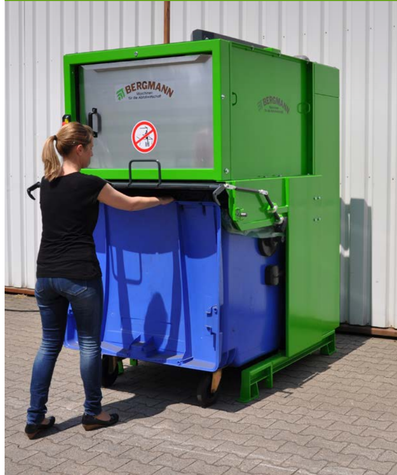
Fig.: BERGMANN APS 1100-E (here with accessory equipment chute) needs approx. 2,00 m 3 footprint and max. 2,60 m height.

When the bin is full with compacted material it can be moved to the collection place easily where it will be emptied by a refuse collection vehicle.