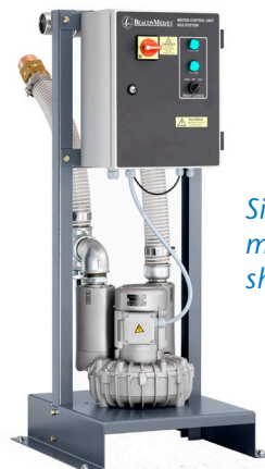
Simplex model shown

Simplex systems are allowed. However, HTM02-01 states that wherever a single AGS pump is provided for a single operating suite, a spare pump for up to six units should be provided for immediate connection into the system in the event of failure.