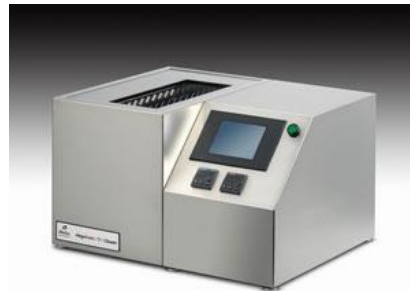
ProSys Table Top Unit Standalone single wafer/substrate cleaner. Recirculated and filtered stainless steel tank, LCD touch screen controls, 1 or 2 MHz operation