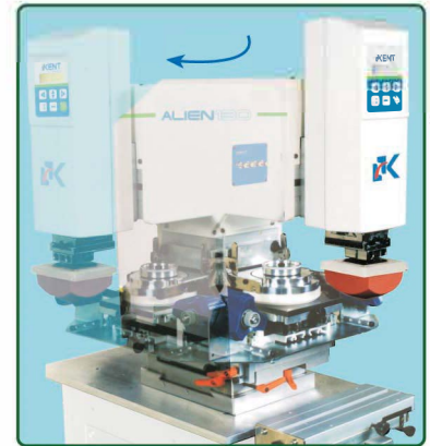
Turn 90° for easy pad/plate change