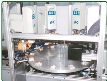
Alien on turn table