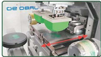
Platform in / out movement & pad clean underneath design for max. product size