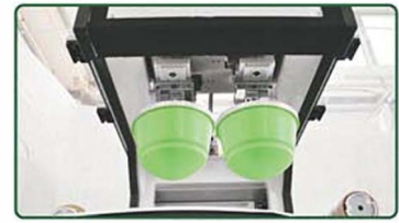
2 independent pad cylinders