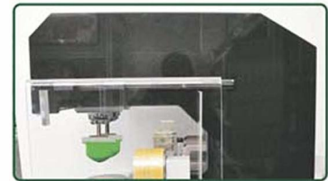
Stable granite stone machine structure