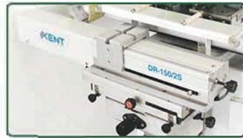
2 color pneumatic shuttle