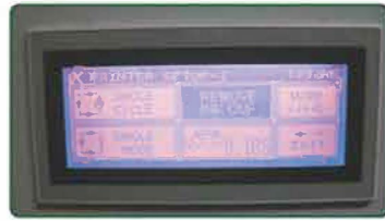
PLC control touch screen panel