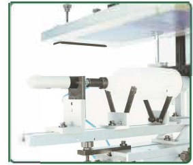
Air inflation unit