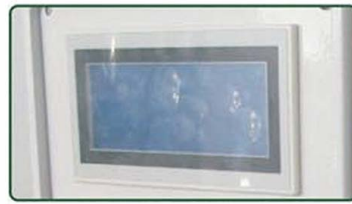
PLC control touch screen panel