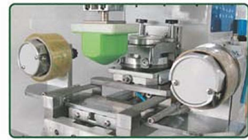
Auto pad clean