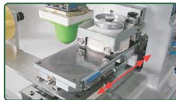
Platform in / out movement (Pad clean underneath)