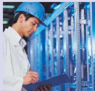
(1) Please check the service coverage in your area.