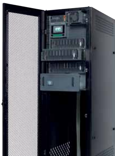
Hot-swap power modules, bypass and batteries in an electronics-free system: no single point of failure and risk-free maintenance.