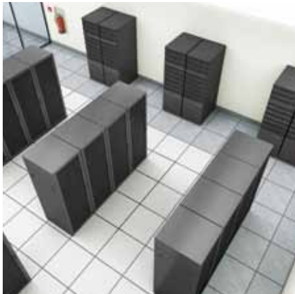
GREEN 115 A

Companies running high-performance computing systems or critical automated processes need solutions that match their application requirements. The constant changes involved means that data center, IT and facility managers face a complex balancing act: maximizing availability, keeping costs down and maintaining a flexible infrastructure.