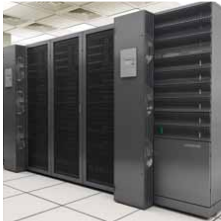
GREEN 114 A