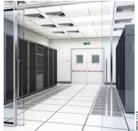
GREEN 113 A