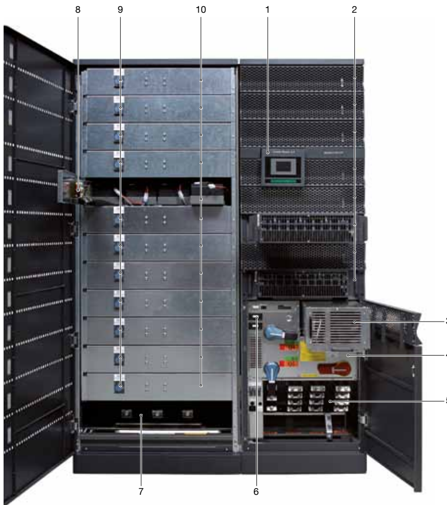
Modular battery cabinet