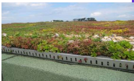
Bespoke metal edging hot-glued to waterproofing

A flat green roof is classed as having a pitch of three degrees or less