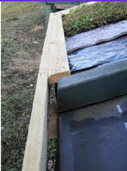
Timber edging screwed to the edge of the building

A pitched green roof has a slope between 3.5 and 20 degrees pitch