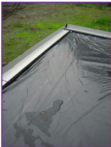
Metal edging attached with 5mm thick adhesive pads