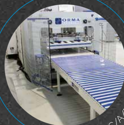
ORMA NPC/A/R/ DIGIT 10/200