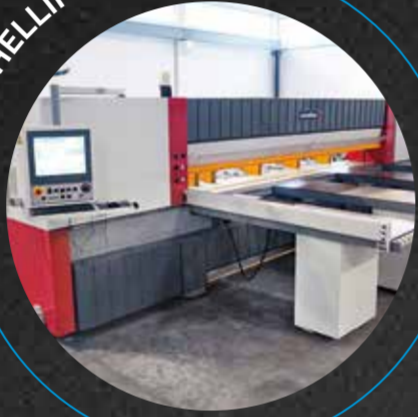
SCHELLING FH6 430/430