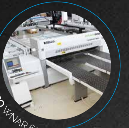
SELCO WVAR 600L