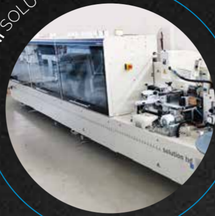
STEFANI SOLUTION HD-RT4