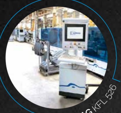
HOMAG KFL 526