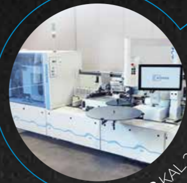
HOMAG KAL 210 AMBITON 221