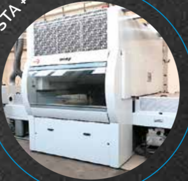
COSTA + CEFLA