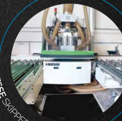
BIESSE SKIPPER 130