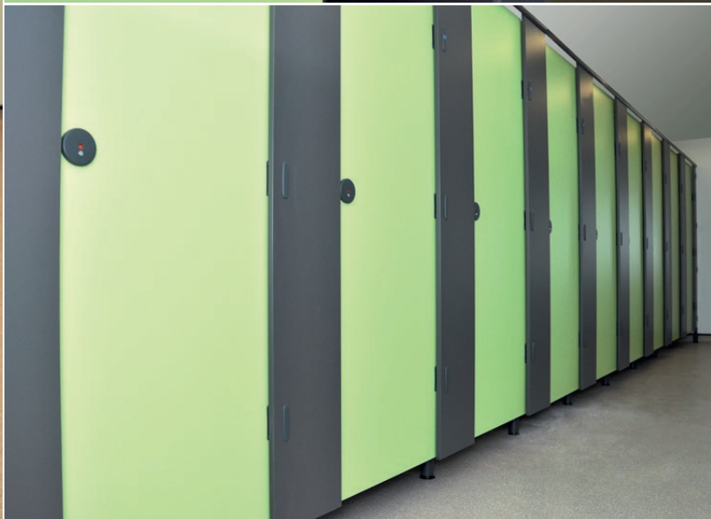
Top Left: Zest 'D' shaped headrail in Stone Grey