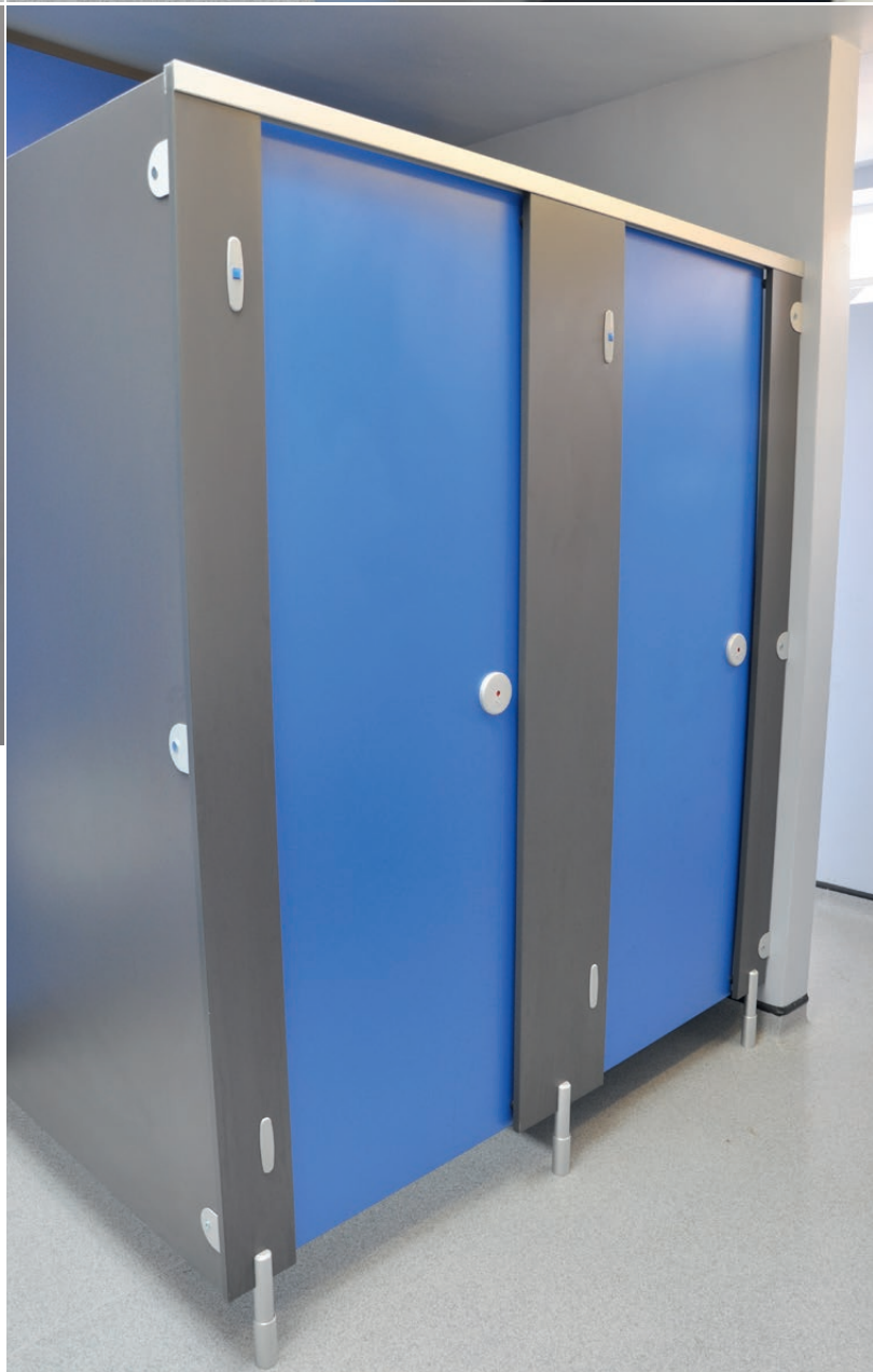
Top Left: Urinal with Blue and Stone Grey panel system Top Right: Vanity units with splash back Right: Two corner cubicles Above: Inside of the boy's cubicle at the Junior School