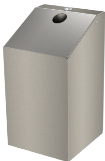
:: Sharps bin holder