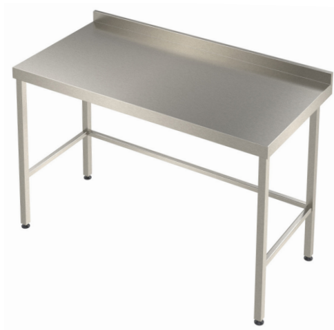
:: Table with Upstand