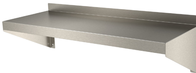
:: Wall mounted shelf