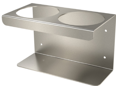
:: Twin bottle holder

For more information and to discuss your exact requirements please contact CES sales@cesltd.uk.com