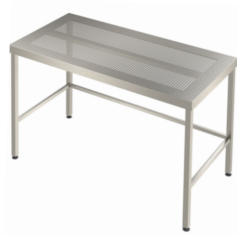
:: Perforated Table