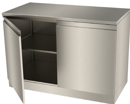
:: Free standing floor cupboard