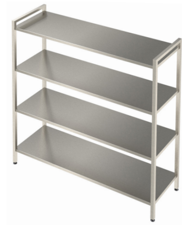
:: Free Standing Rack

For more information and to discuss your exact requirements please contact CES sales@cesltd.uk.com