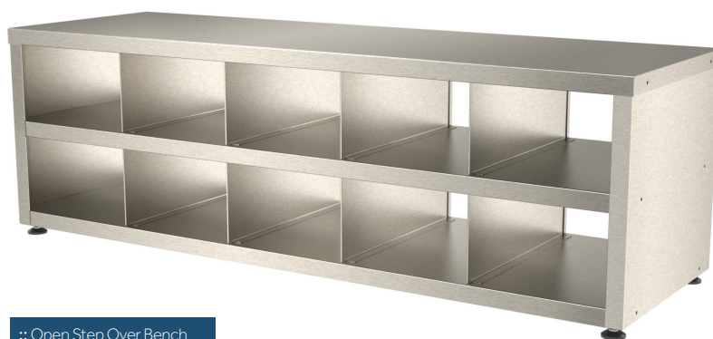
:: Open Step Over Bench