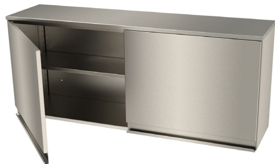
:: Wall mounted cupboard