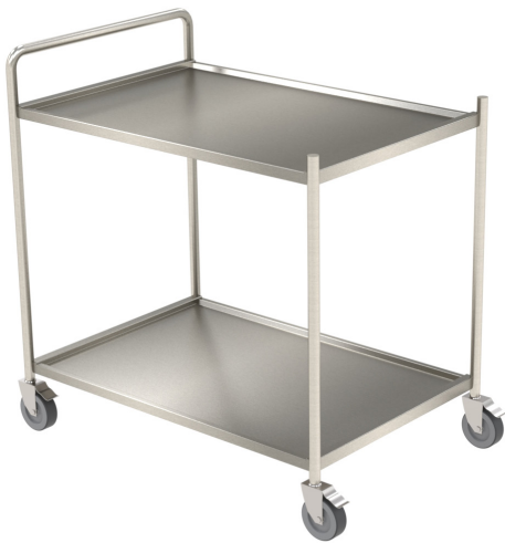
:: Trolley two

For more information and to discuss your exact requirements please contact CES sales@cesltd.uk.com