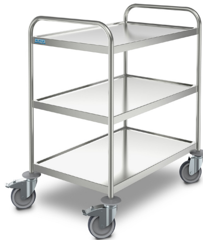
:: Trolley three