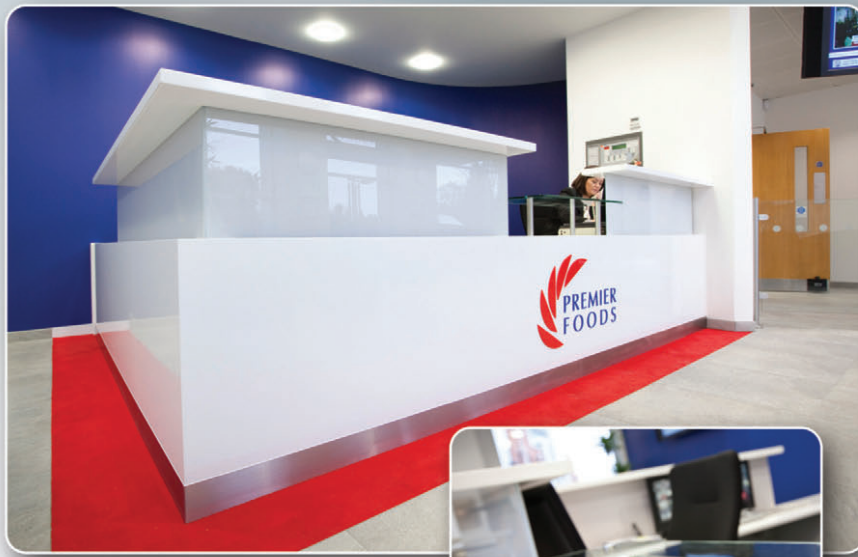
Signing-In Section Toughened clear glass tablet on stainless steel posts