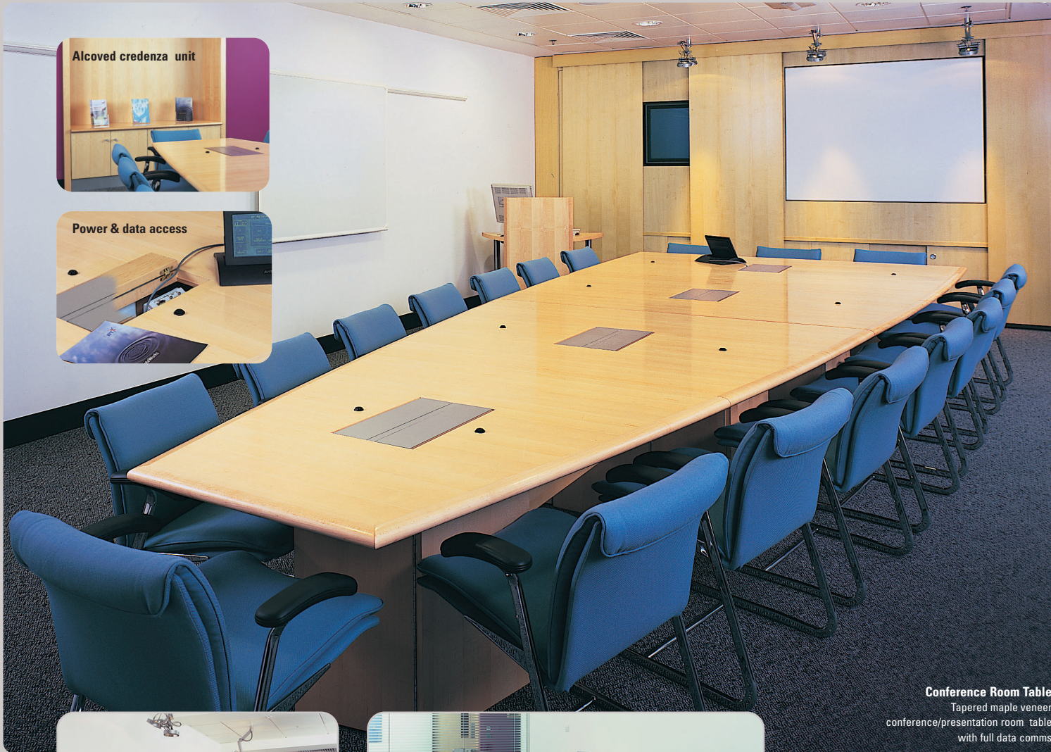
Conference Room Table

Tapered maple veneer conference/presentation room table with full data comms