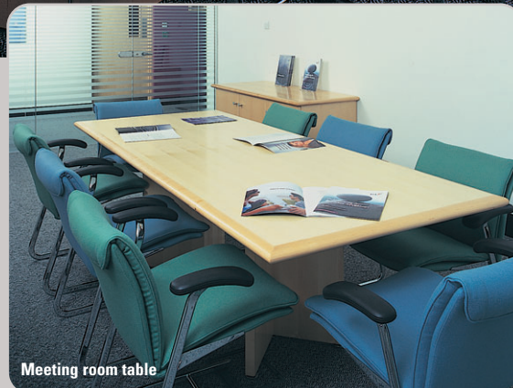
Meeting room table

5m bespoke sofa and coffee tables for breakout area