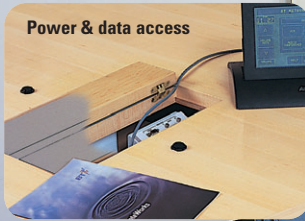
Power & data access