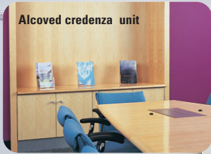
Alcoved credenza unit

Tapered maple veneer conference/presentation room table with full data comms