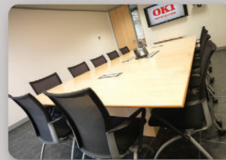
Training room tables: Maple veneer tops with contrasting oak hardwood edge lipping and power docks.