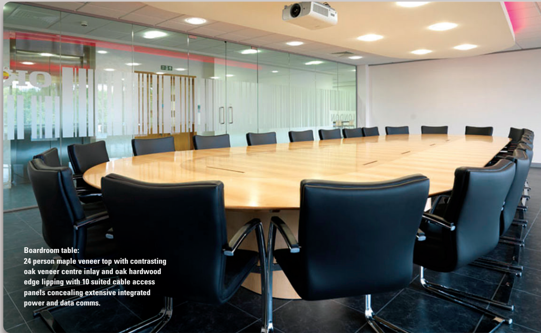
Boardroom table: 24 person maple veneer top with contrasting oak veneer centre inlay and oak hardwood edge lipping with 10 suited cable access panels concealing extensive integrated power and data comms.

"With Clarke Rendall, the quality of product is excellent, but for me it's the quality of service that sets them apart - to them, nothing is a problem."