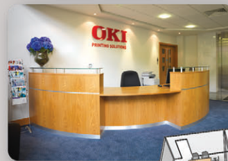
Reception Desk: Colour matched oak veneer evolution® eclipse special (based on the YBP-2DDA-FP standard product)