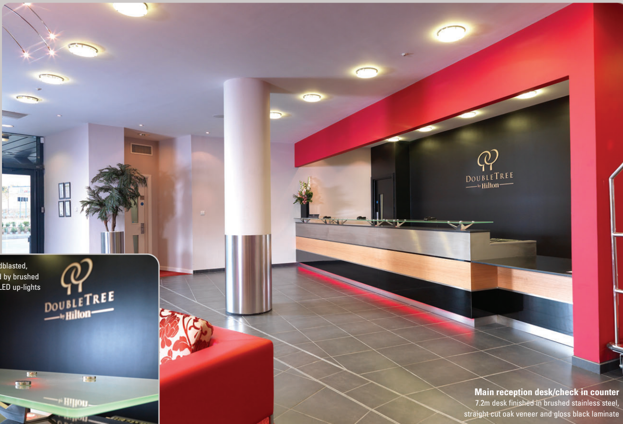
Black granite counter top with sandblasted, toughened glass counter supported by brushed stainless steel claws with integral LED up-lights