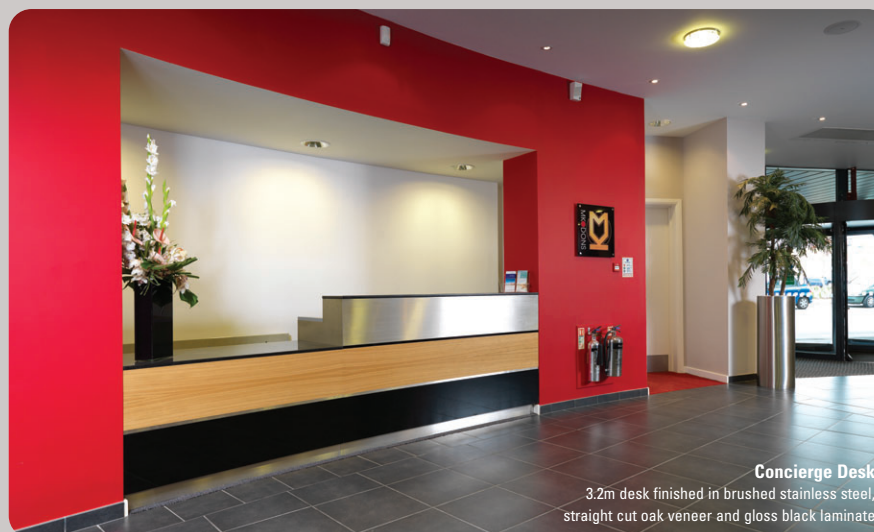
Concierge Desk 3.2m desk finished in brushed stainless steel, straight cut oak veneer and gloss black laminate