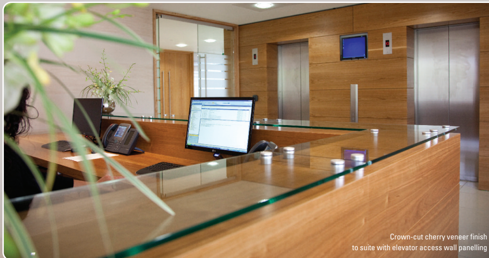
Crown-cut cherry veneer finish to suite with elevator access wall panelling