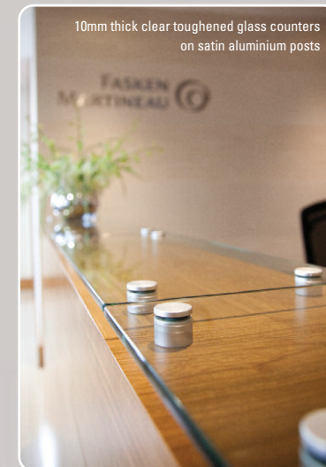
10mm thick clear toughened glass counters on satin aluminium posts