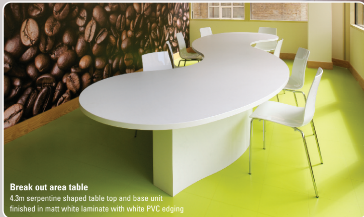
Break out area table 4.3m serpentine shaped table top and base unit finished in matt white laminate with white PVC edging