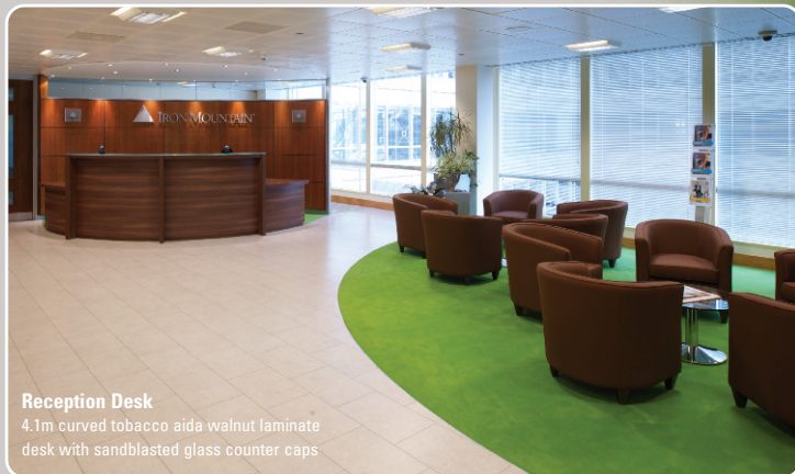
Reception Desk 4.1m curved tobacco aida walnut laminate desk with sandblasted glass counter caps

"I've known Clarke Rendall for probably fifteen years, and I knew I'd get the quality I wanted - It's as simple as that"