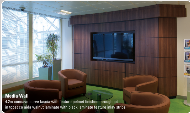
Media Wall 4.2m concave curve fascia with feature pelmet finished throughout in tobacco aida walnut laminate with black laminate feature inlay strips