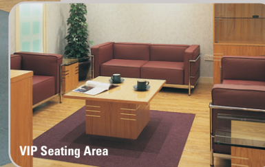
VIP Seating Area