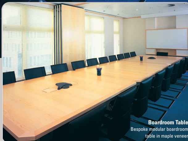
Boardroom Table Bespoke modular boardroom table in maple veneer