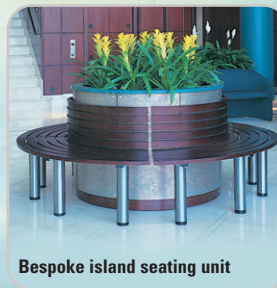
Bespoke island seating unit