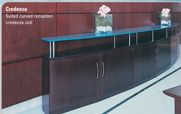
Credenza Suited curved reception credenza unit