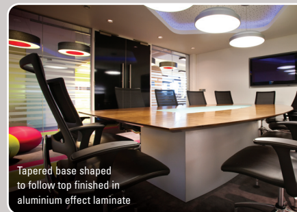
Tapered base shaped to follow top finished in aluminium effect laminate