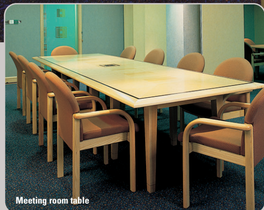
Meeting room table

Bird's eye maple and figured aspen with decorative feature wenge central and perimeter inlays.