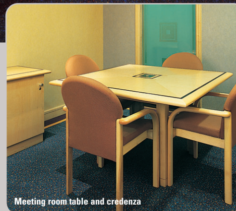
Meeting room table and credenza