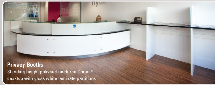
Privacy Booths Standing height polished nocturne Corian® desktop with gloss white laminate partitions