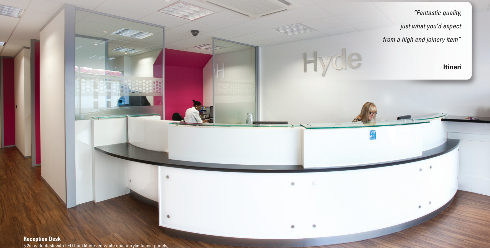
Reception Desk 5.2m wide desk with LED backlit curved white opal acrylic fascia panels, polished nocturne Corian® desktop and gloss white laminate raised upstands with toughened clear glass counter caps on brushed stainless steel posts.