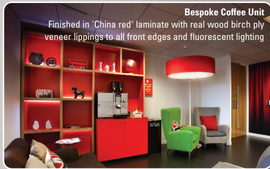
Bespoke Coffee Unit Finished in 'China red' laminate with real wood birch ply veneer lippings to all front edges and fluorescent lighting