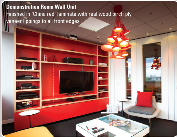
Demonstration Room Wall Unit Finished in 'China red' laminate with real wood birch ply veneer lippings to all front edges

Project: Virgin Media Dealer: Steelcase Business Area: Office/Commercial