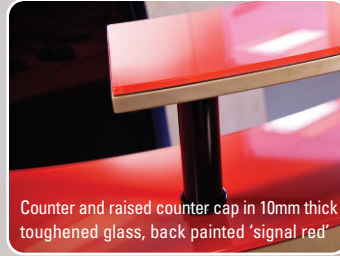
Counter and raised counter cap in 10mm thick toughened glass, back painted 'signal red'