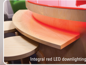
Integral red LED downlighting

Project: Virgin Media Dealer: Steelcase Business Area: Office/Commercial