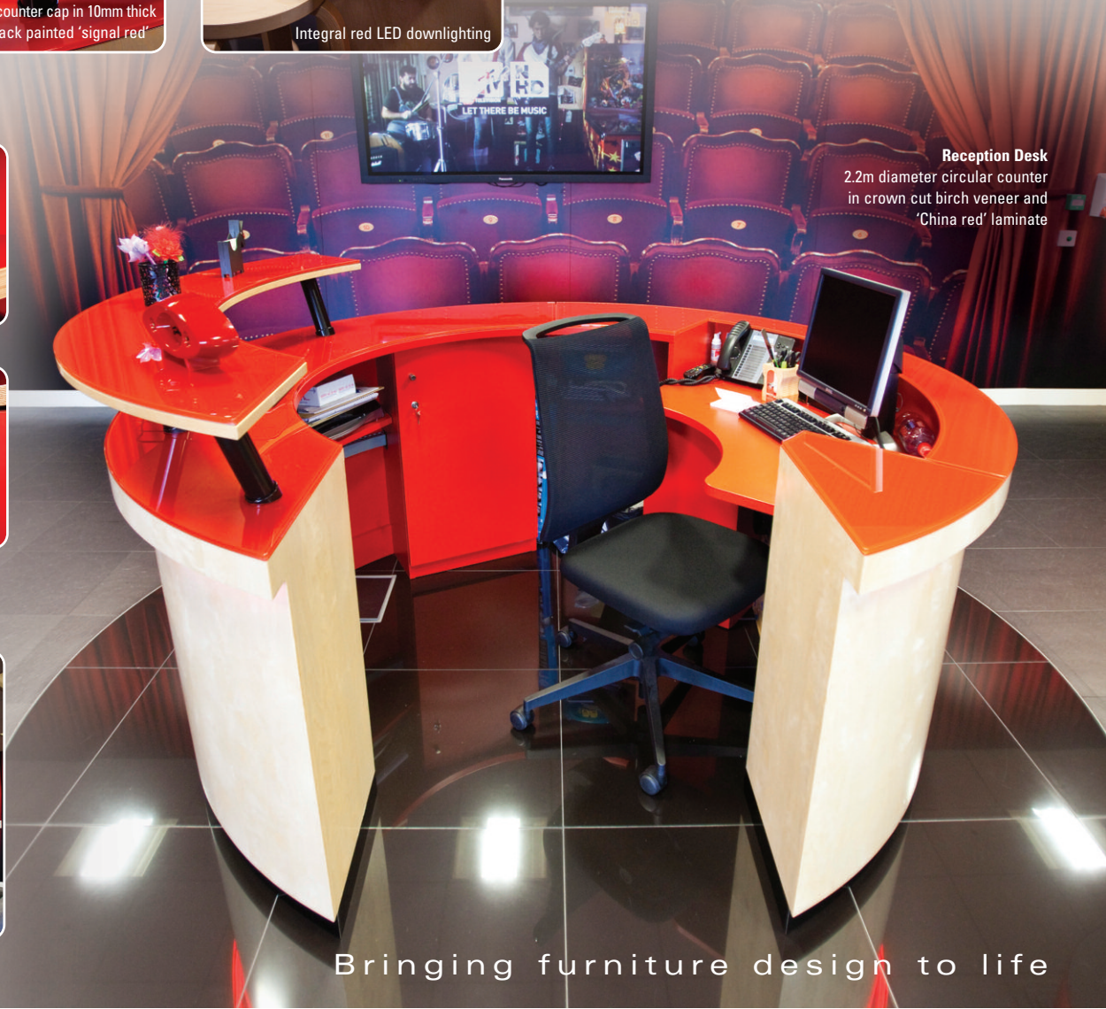
Reception Desk 2.2m diameter circular counter in crown cut birch veneer and 'China red' laminate