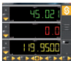
Multi channels screen with tolerances displayed in colour