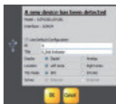
Automatic instrument detection and configuration window