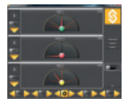
Multi channels screen displayed in analog mode