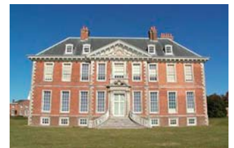
Uppark: completed Fire Alarms and Emergency Lighting supply and maintenance